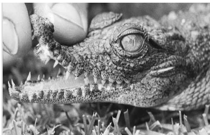
Figure 3 - 'Rubber jaws' and 'glassy teeth' in a Nile crocodile hatchling with osteomalacia.

Feeding frozen fish has two limitations; the first is that fresh and frozen fish often contain large amounts of the enzymes thiaminases. Freezing appears to increase the concentration of the thiaminases in the tissue of fish, which destroys the vitamin B 1 (thiamine); the second problem is an accumulation of fats in the subcutaneous and intramuscular tissue leading to paralysis of the legs, which is caused by particularly oily fish meals (Huchzermeyer, 2002; Huchzermeyer, 2003). For the treatment of nutritional bone disease, it is necessary to rectify the diagnosed deficiency, usually that of calcium. If the affected hatchlings are too weak to feed by themselves, they can initially be dosed or injected intra-peritoneal (IP) with calcium borogluconate (250 mg/ml), at a dosage of 1.5ml/kg body mass. The corrected ration should contain additional calcium carbonate, dicalcium phosphate, or sterilized bone meal, to give a final composition containing 1.5–2% calcium and a Ca:P ratio of 1.5:1 (Huchzermeyer, 2003).