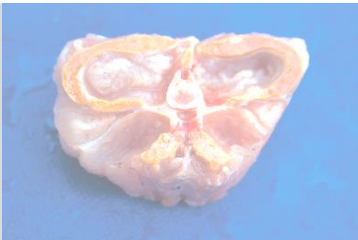
Figure 2 - Fat necrosis: hardened yellow fat between the tail muscles of a Nile crocodile.

The clinical assessment of the previous study 25% (20 out of 80) had clinical abnormalities; 5 of the crocodiles were unable to move on dry land during basking, showing paralysis of two hind legs and slight swelling of the tail muscle, and yet were able to swim 'normally'. A further 5 animals showed multiple skin lesions, 5 showed circling movement while swimming in the water, and the remaining animals were dead before the examination. During post mortem examination, there was excessive yellow and hard fatty accumulation was identified in tail muscles. 6.25% (5 out of 80) had multiple skin lesions which were multiple and dominated by small erosions, on the ventral aspect of the abdomen and One crocodile showed ulcerative types of skin lesion over its head, neck, back, and tails. The sick crocodiles were found dead after 2-4 weeks. And showed accumulation of fluid in the pericardial sac slightly enlarged pale heart and liver. Most of these problems were observed on juveniles (young) and yearlings and occurred after they were provided with frozen fish meat ( Mahammed, 2008 ).